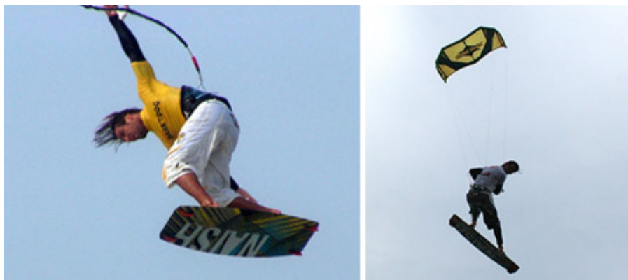
A bit of competition action ....